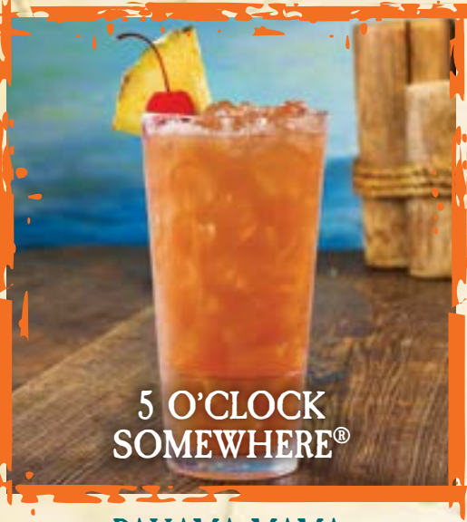
5 O'CLOCK SOMEWHERE®

*2,000 calories a day is used for general nutrition advice, but calorie needs vary. Additional nutrition information available upon request.